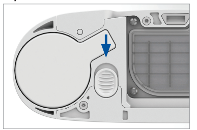
Open and unlocked

7. While holding the button open, slide the column (metal tube) out by gripping the exposed aluminum surface with other hand.