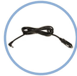
Inogen One ® G4 DC Power Cable* Item # BA-306