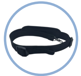
Inogen One ® G4 Carry Strap* Item # CA-401