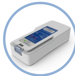
Inogen One ® G4 Extended Life Lithium Ion Battery** Up to 5 hours run time † Item #BA-408