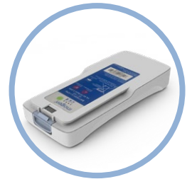
Inogen One ® G4 Lithium Ion Battery* Up to 2.7 hours run time † Item #BA-400