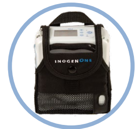
Inogen One ® G4 Carry Bag* Item # CA-400